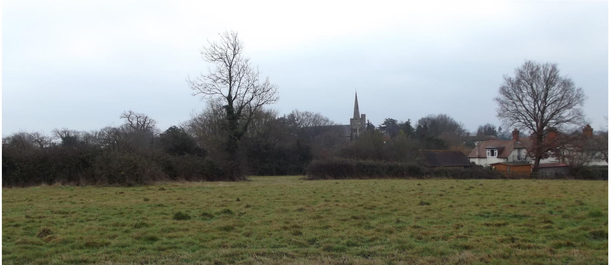
View of church from centre of site