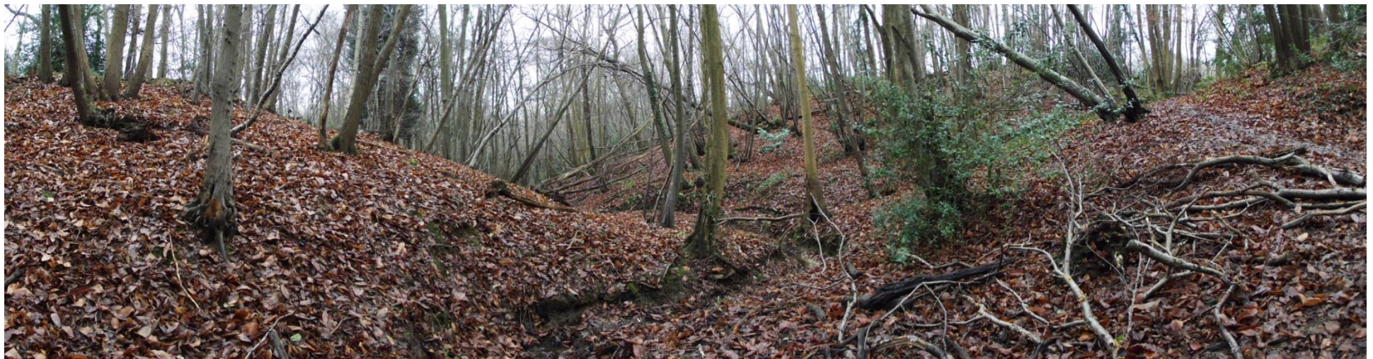
View of Harlots Wood – Ancient Woodland