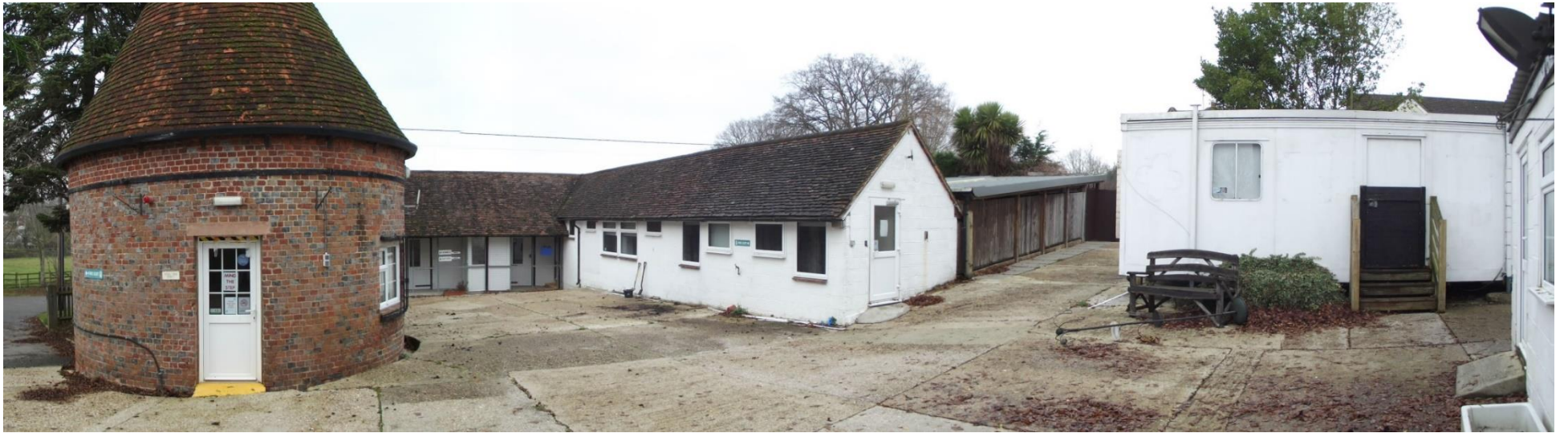
Oast house and other outbuildings in central core