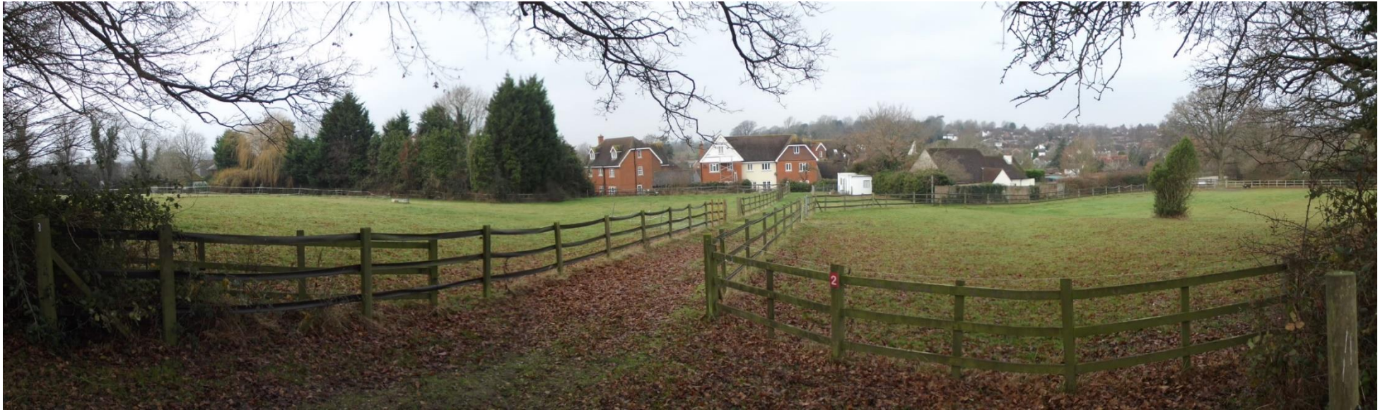
View across fields from the high ground behind central buildings